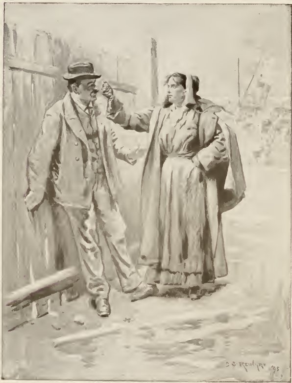
Lathers shrank back, cowering before her (page 27)